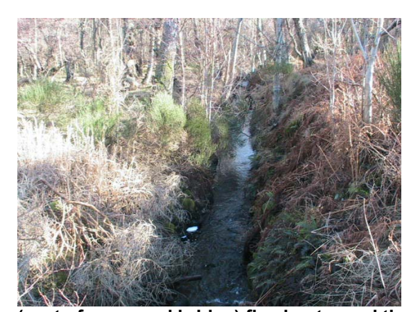
Fig. 4: the burn (east of proposed bridge) flowing toward the River Dee SAC