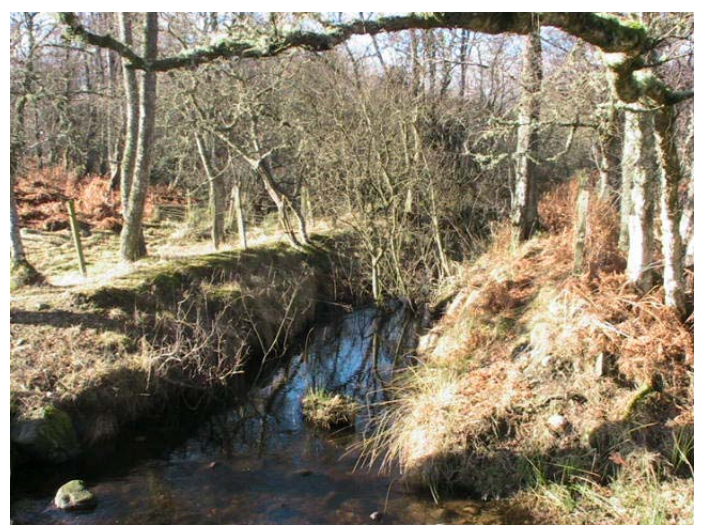
Fig. 2: Location of proposed footbridge

1. Full permission is sought in this application for the erection of a footbridge across a burn that flows between Loch Kinord to the west and Clarack Loch to the east, on land north of Clarack Farm, near Dinnet, Aboyne.