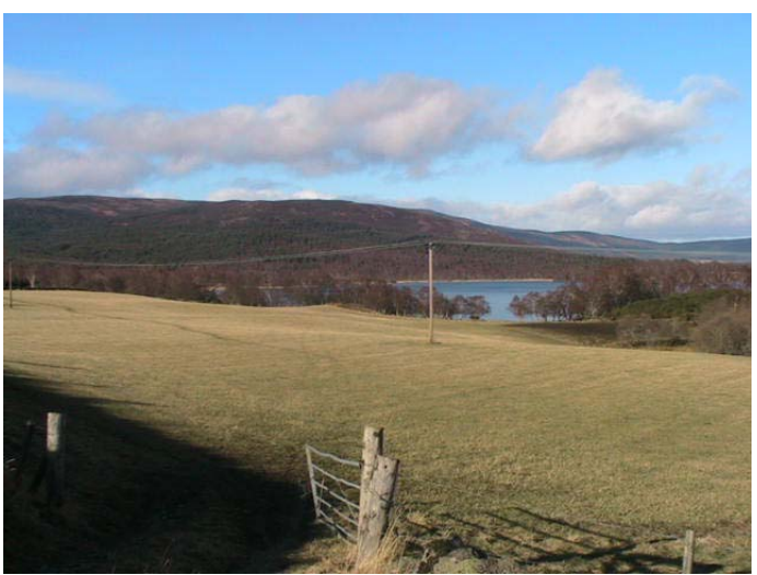
Fig. 3: View of Loch Kinord and the potential future route of a path along the south side of the Loch between Meikle Kinord and Clarack

extent of creating aggregate paths, and state instead that work such as strimming and pruning will be carried out in order to create more clearly defined routes. The off shoot of the future 'Loch Kinord Circular Route One' leading from the location of the proposed footbridge towards the car park at Dinnet would obviate the current need to access the track in the vicinity of Carlochy and Clarack Farm by first walking along the public road from the car park at Dinnet.